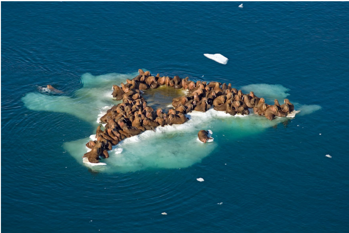
Fig. 7 Sea ice ecosystems in decline. Walrus use sea ice as a haul out platform over foraging areas, and substantial declines in their populations are predicted in response to sea-ice reduction (Jay et al. 2011).

communities. Changing sea-ice conditions therefore have wide ranging impacts on Arctic marine food webs, including direct and indirect effects on ice-associated marine mammals (details in Kovacs et al. 2011). Whale species may differ greatly in their sensitivity to ice change depending on their degree of specialization and flexibility in diet. Narwhals are likely to be strongly impacted by the loss of pack ice in their winter-time benthic feeding regions, while the more generalist feeding habits of beluga and bowhead whales may allow them to adjust more readily to changes in the Arctic marine ecosystem caused by loss of sea ice. Gray whales and other migratory species are likely to expand their ranges and periods of residency in the Arctic. Polar bears are especially prone to negative consequences of the changing sea-ice conditions (Fig. 8), and drastic declines have been predicted (e.g., Durner et al. 2009), including complete extirpation from many areas where they are presently common (Regehr et al. 2010). The ecology of terrestrial species that use sea ice seasonally as a foraging habitat (e.g., Arctic fox, Tarroux et al. 2010) will also be strongly modified by sea-ice decline.