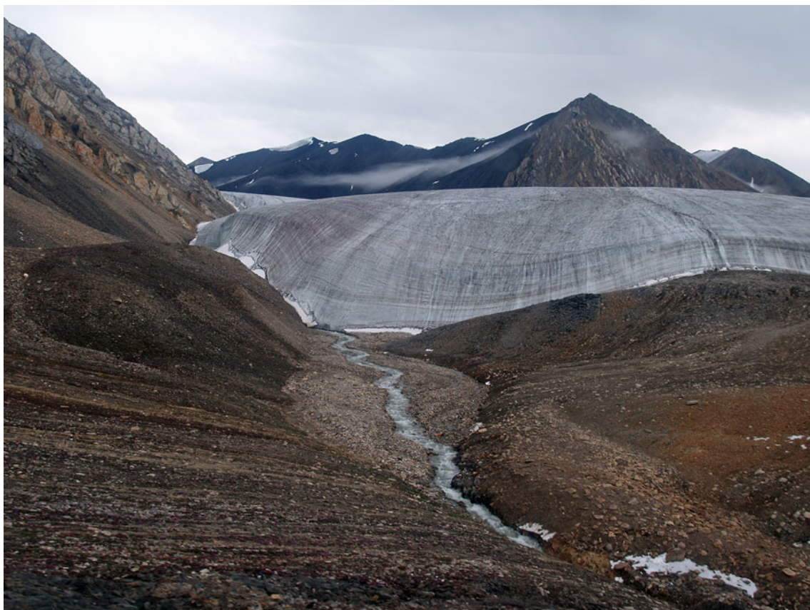
Fig. 5 Glacial retreat and new terrestrial ecosystems. The melting of glaciers throughout the Arctic (Sharp et al. 2011) is causing large fluctuations in river discharge, and is exposing new land for

Arctic glaciers provide a habitat for cryoconite microbial communities, as well as water supplies for streams, rivers, wetlands, and the coastal ocean (Sharp et al. 2011). From the 1990s onward, there have been increasing rates of mass loss from glaciers in Alaska, the Canadian Arctic, and Iceland, and this trend is likely to continue over the next few decades. In the medium-term, ongoing increases in discharge may stimulate benthic invertebrate diversity (e.g., Milner et al. 2008) and enhance salmonid populations (e.g., Fleming 2005). In the longer-term, the glacial recession (Fig. 5) will open up new terrestrial habitats for colonization by microbes and plants (e.g., Breen and Lévesque 2006), and culminate in declining river discharges and changing stream patterns (Milner et al. 2008). Higher temperatures are likely in the absence of glacial meltwater inputs, which are likely to favor declines among