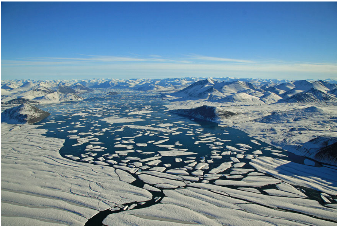
Fig. 6 Extinction of ice shelf ecosystems. Accelerated breakup of ice shelves along the northern coast of Nunavut, Canada, is resulting in the loss of unique microbial ecosystems such as the Ward Hunt Ice

Ice covers Arctic lakes for 6–12 months each year and therefore has a major influence on the physical, chemical, and biological characteristics of these ecosystems. There is evidence of earlier breakup and delayed freeze-up at many sites, and this trend is predicted to accelerate in the future (Prowse et al. 2009, 2011a, b [this issue]). Paleolimnological studies suggest that the shorter duration of snow and ice cover results in higher primary production at sites throughout the Arctic (Hodgson and Smol 2008, and references therein), associated with more light availability for photosynthesis, increased wind-induced mixing, and increased nutrient inputs from catchments in a warmer climate. The longer ice-free period may drive some lakes from cold monomixis (one period of mixing a year) to dimixis (two periods of mixing a year) systems, potentially resulting in warmer waters, shifts in zooplankton communities, and increased contaminant transfer to high trophic levels (details in Vincent et al. 2011). These warmer conditions may force cold-adapted specialists into more