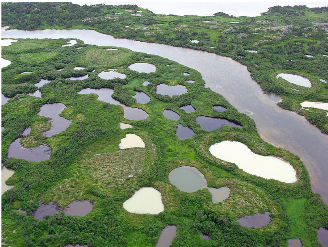
Fig. 4 Permafrost landscapes in transition. Thaw lakes and ponds are eroding and draining in some Arctic regions, while in other areas such as in here in Nunavik, Canada, they are expanding (Callaghan et al.

Arctic freshwater systems provide important migratory routes for fish, and changes in climate may alter the connectivity among lakes and river channels, as well as the physical coupling to the coastal marine ecosystem. Glacier-fed rivers are showing sustained periods of higher discharge associated with the increased duration and intensity of melt under a warmer climate, and this provides more favorable habitats for some invertebrate and fish species. Increasing discharge has also been observed in the large Siberian rivers, with record flows in 2007 (Shiklomanov and Lammers 2009). This may result in increased nutrient and allochthonous (external) organic matter inputs to the Arctic Ocean that stimulate processes at the base of the marine food web. However, this fresh water combined with the large-scale melting of sea ice is reducing the salinity of the Arctic Ocean mixed layer, thereby intensifying stratification. In recent years, freshening of the Arctic Ocean surface waters has been accompanied by a shift in phytoplankton toward small-celled species that are more