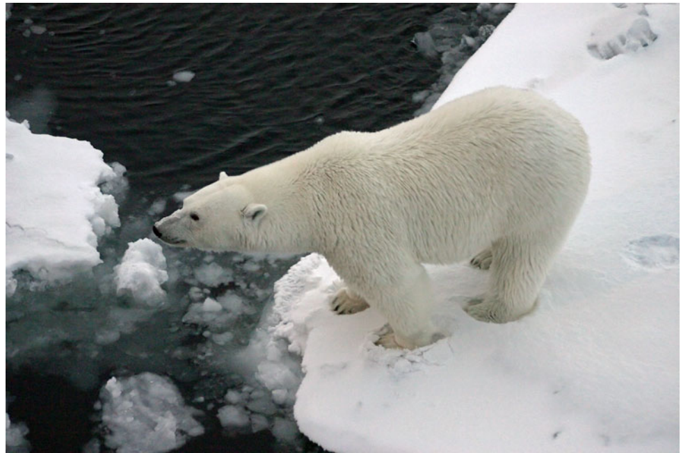
Fig. 8 Declining polar bear habitats. Continental shelf waters partially covered by sea ice provide the optimal habitat for polar bears and the seals they prey upon. Large declines are predicted over the twenty-first century, with considerable variation among different sectors of the Arctic Ocean (Durner et al. 2009).

landscape and thereby the biological productivity and biodiversity of northern regions. Permafrost provides an impermeable barrier that prevents drainage, and the resultant high water table favors wetlands, lakes, and ponds, and their associated biota (Woo and Young 1998). Qualitatively different responses are being observed to the erosion of permafrost soils, including creation of lakes and wetlands, conversion of forests to fens, and increased drainage with loss of lakes or little change in vegetation (Jorgenson and Osterkamp 2005).