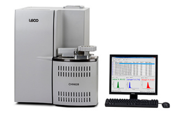
Figure 3. LECO CHN628 Elemental Determinator.

Figure 2. Sampling depths of the ADAPT active layer sampling protocol.